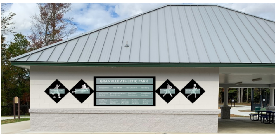
This rendering is for illustrative purposes only.